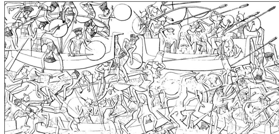
▲ Relief portraying the battle between the Sea Peoples (including the Philistines) and the Egyptians and Ramesses III, from Medinet Habu, 1174 BC.