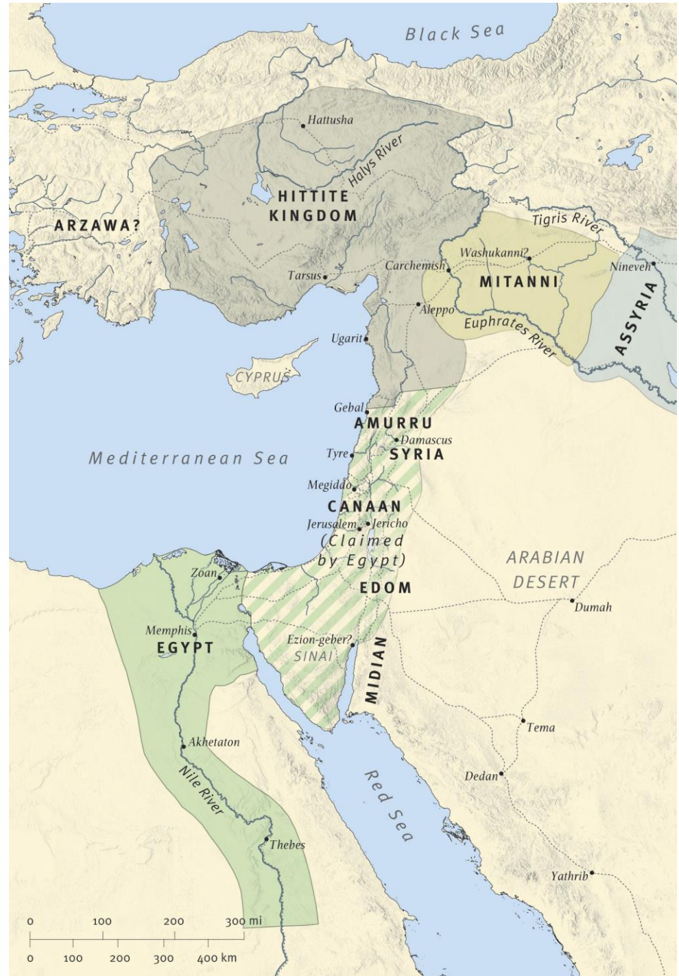
Map 3-1, ESV Bible Atlas