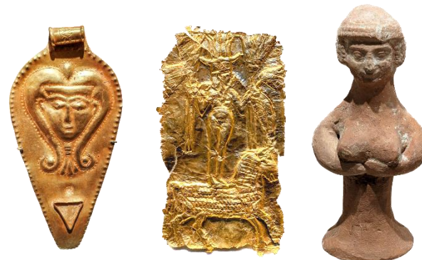
◀ Gold and clay representations of Astarte, the Canaanite goddess of war and fertility; from the 14 th , 13 th , and 8 th centuries BC.