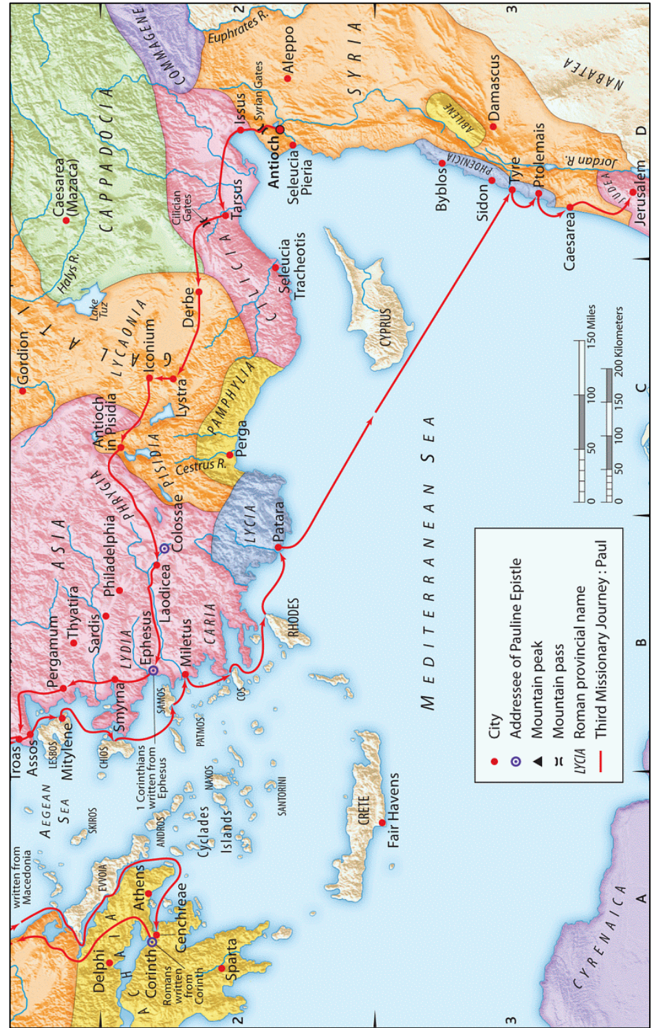
New Moody Bible Atlas, map 112.