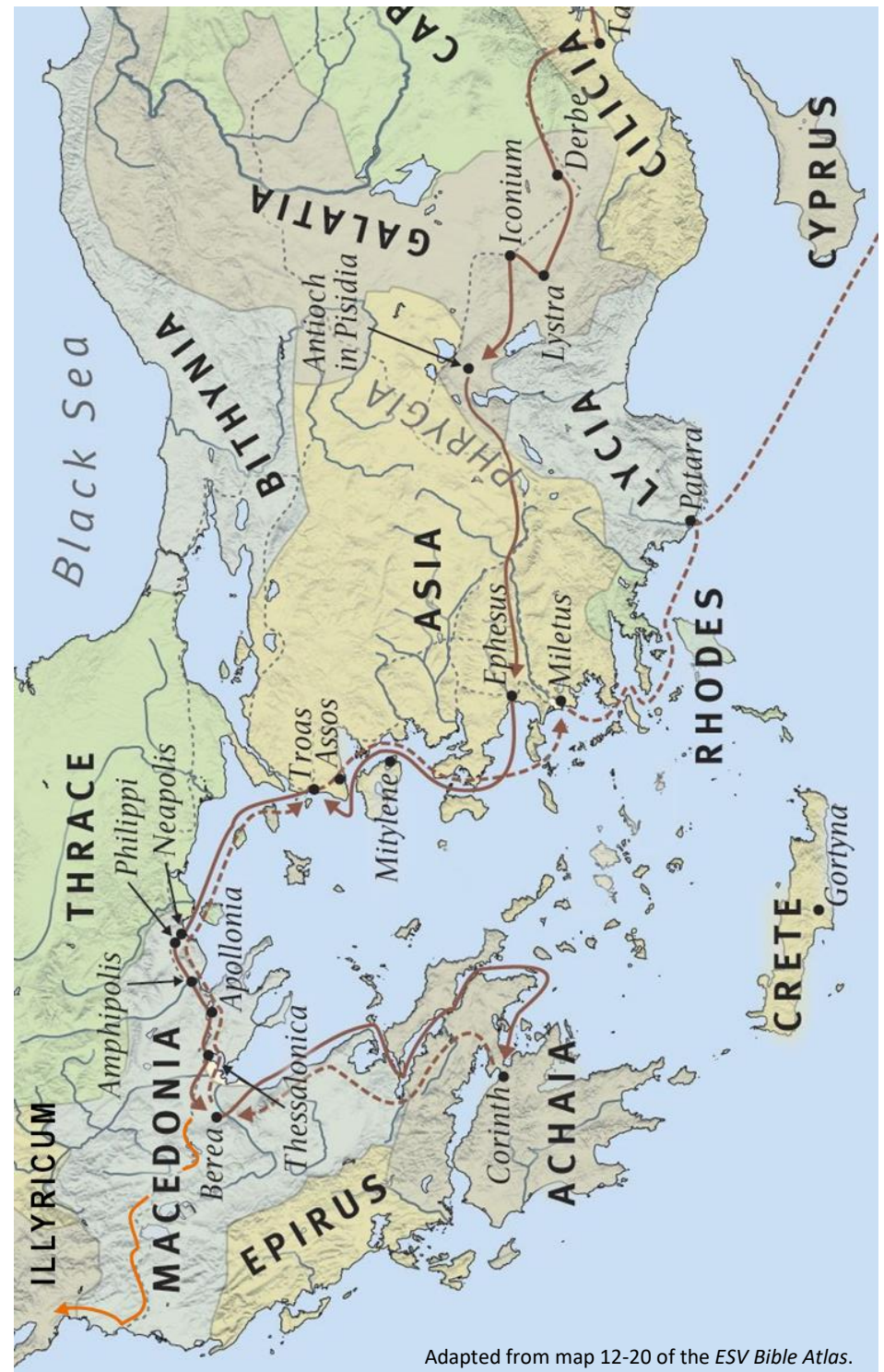
Adapted from map 12-20 of the ESV Bible Atlas .