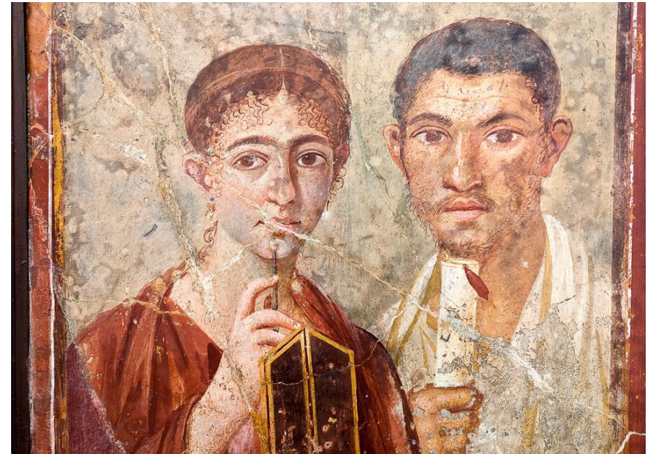
Fresco of Terentius Neo and his wife in the pose of intellectuals, from Pompeii, AD 55-79.