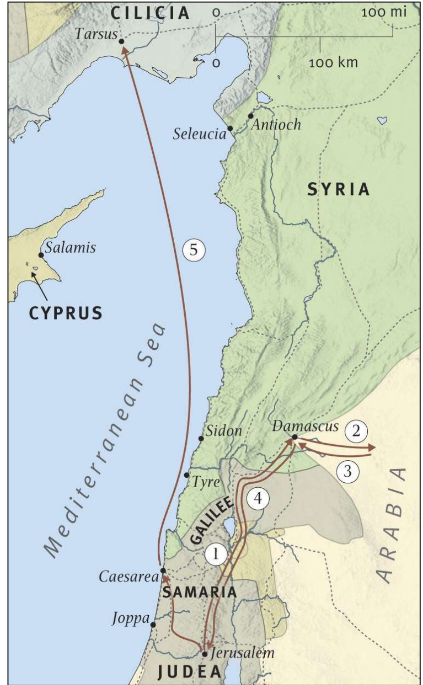
Map showing the travels of Saul from his conversion to his trip to Tarsus, c. AD 34-37. The distance from Jerusalem to Damascus is about 160 miles. This is map 12-16 of the ESV Bible Atlas .