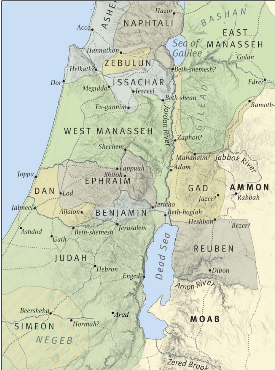
▲ The eastern tribes departed from Shiloh in Ephraim to cross the Jordan River. The nearest ford would have been at Adam, almost straight east at a distance of about 17 miles. This map is adapted from map 4-13 of the ESV Bible Atlas .