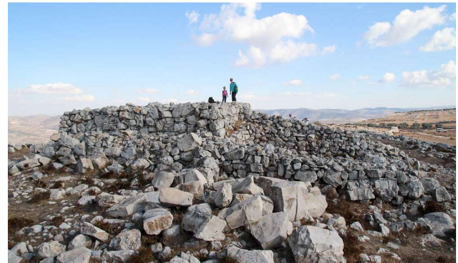
▲ An earlier and even larger altar is this one on Mount Ebal, north of the city of Shechem. The main structure measures 30 by 23 feet (9 by 7 m). Archaeologists have dated the major structure to about 1250 BC, although there also appeared to be earlier remains below the main structure. Some scholars have suggested identifying this altar with the one built by Joshua on Mount Ebal (Josh 8:30).