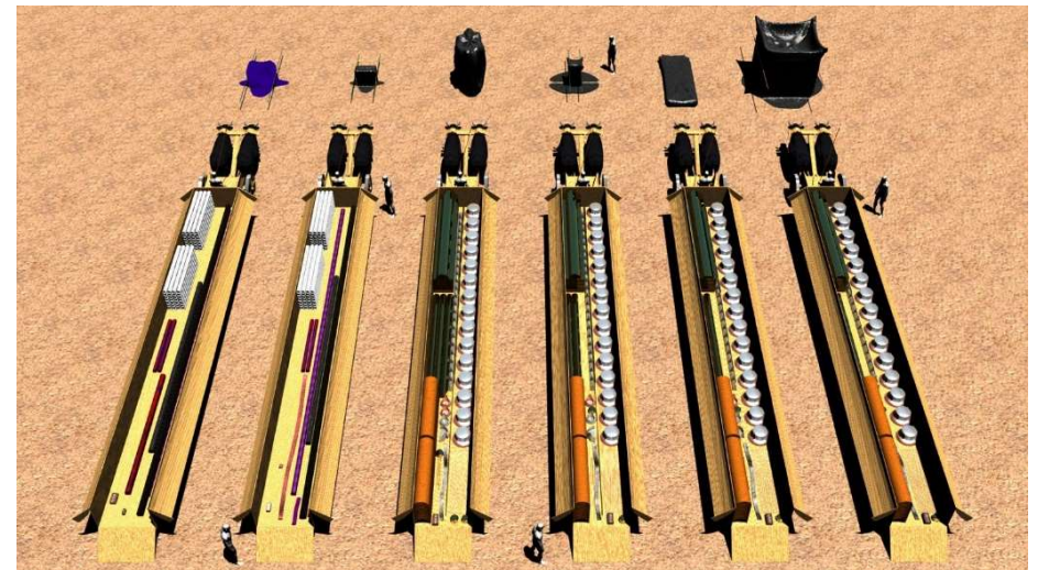
▲ Illustration of the tabernacle parts carried by the various clans of Levi.

Merari – The family of Merari used four wagons (Num 7:8) to carry the solid structure of the tabernacle—the planks, pillars, stands, etc. (Num 3:36–37; 4:31–32).