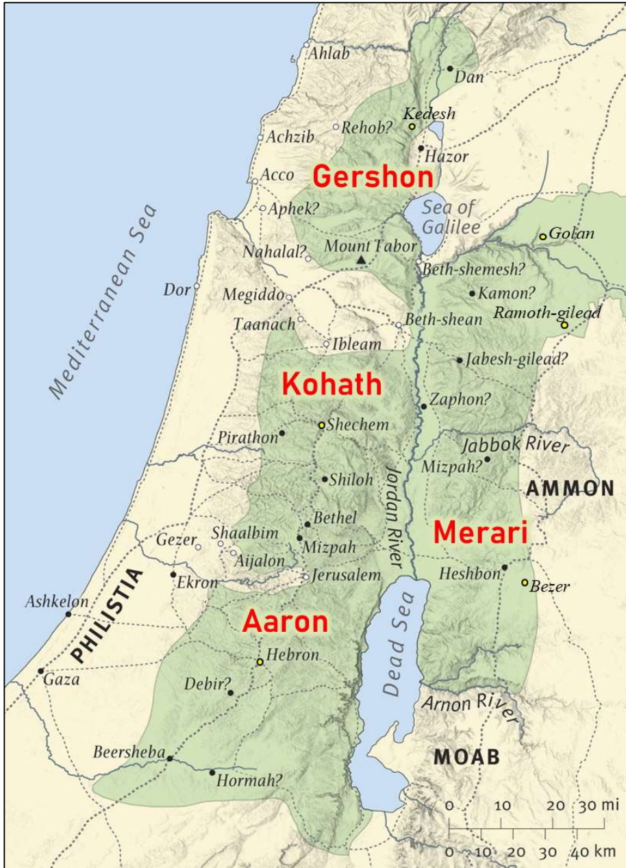
▲ Adapted from map 4-15 of the ESV Bible Atlas.