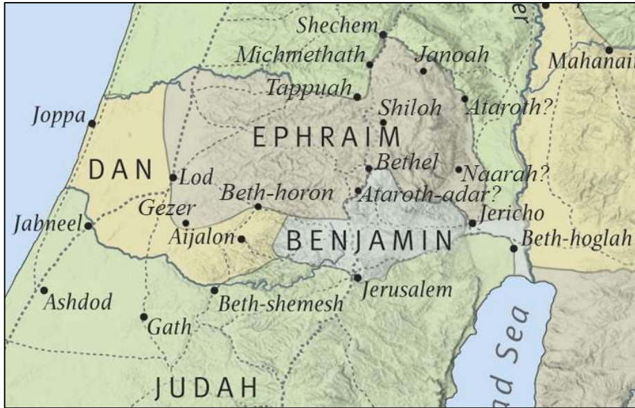
▲ Tribal allotment of Benjamin; from map 4-13 of the ESV Bible Atlas .

Joshua 18:11 Now the lot of the tribe of the sons of Benjamin came up according to their families, and the territory of their lot lay between the sons of Judah and the sons of Joseph.