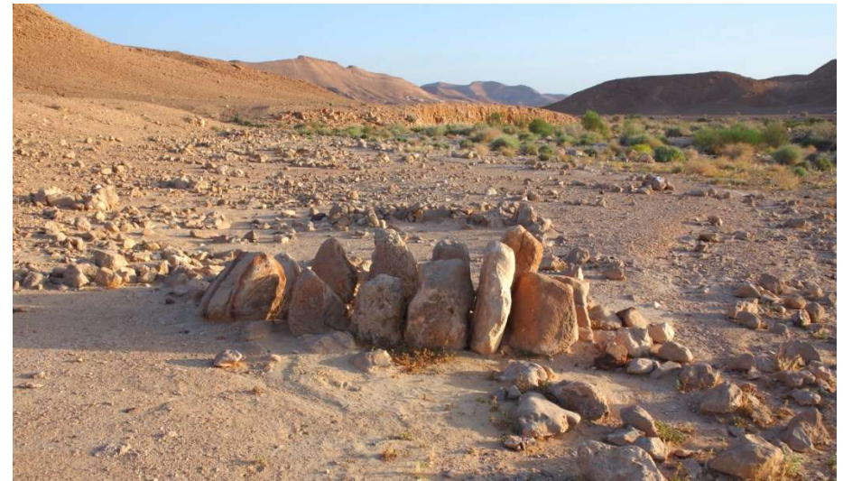
▲ Twelve standing stones at Har Karkom. ▼ Possible locations of Gilgal.