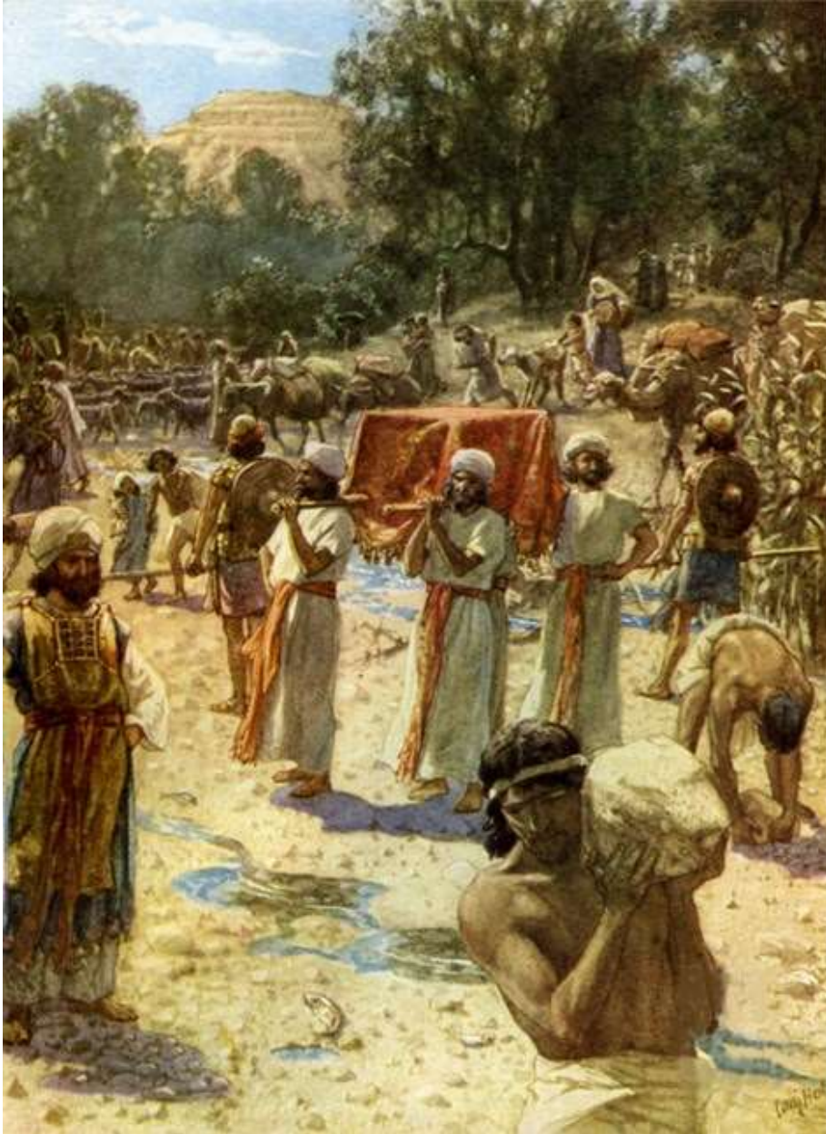
▲ The Passing of the Jordan , by William Brassey Hole.

“These stones are to be a memorial to the people of Israel forever.” Joshua 4:7